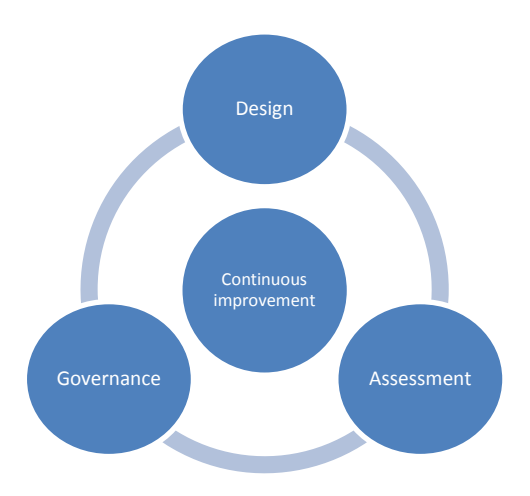
Figure 2 – The Elements of the Guiding Principles

The design, assessment, and governance of a program focuses on assisting an individual to develop the technical competence, professional skills and professional values, ethics and attitudes that will enable achievement of the learning outcomes required for a role as a professional accountant. The Guiding Principles for each of these elements are provided in Table 1.