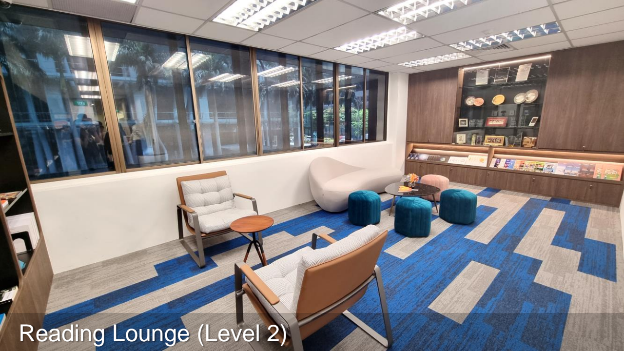
Reading Lounge (Level 2)