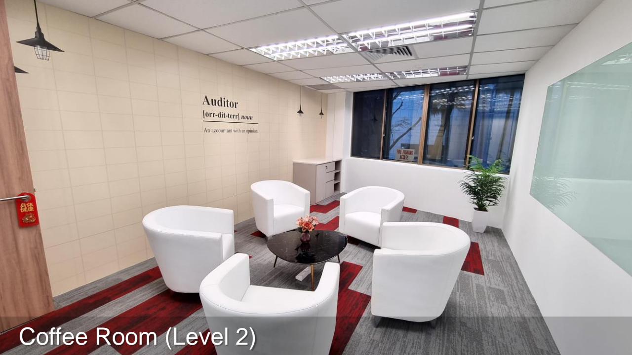
Coffee Room (Level 2)