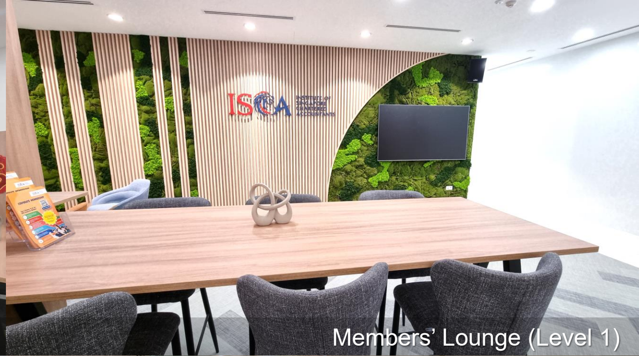
Members' Lounge (Level 1)