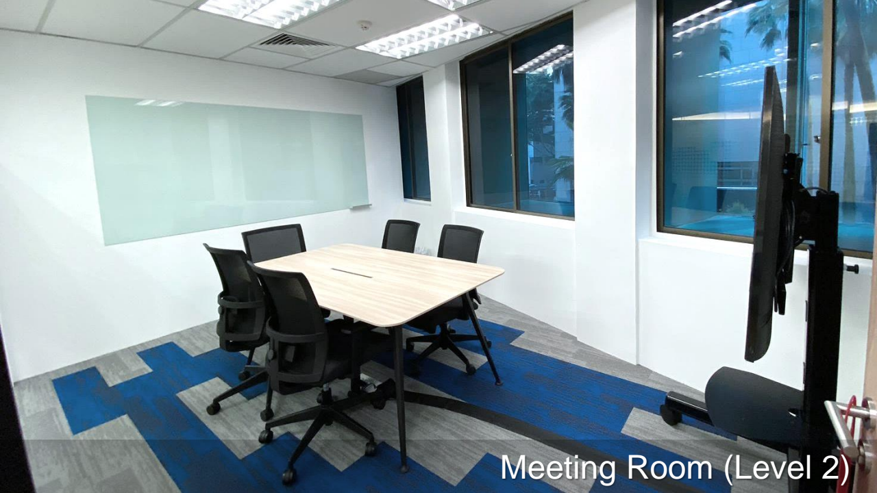
Meeting Room (Level 2)