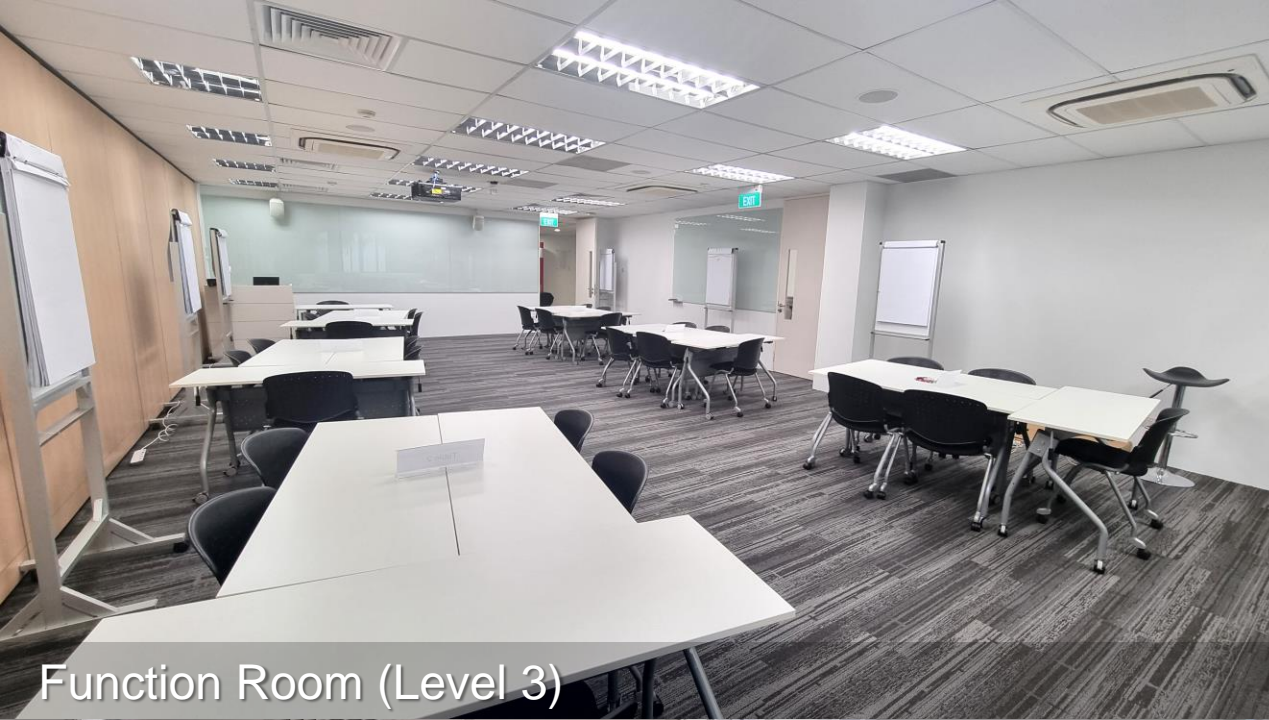
Function Room (Level 3)