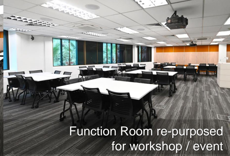
Function Room re-purposed for workshop / event