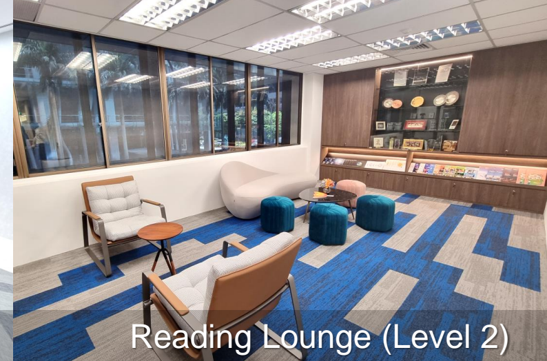
Reading Lounge (Level 2)