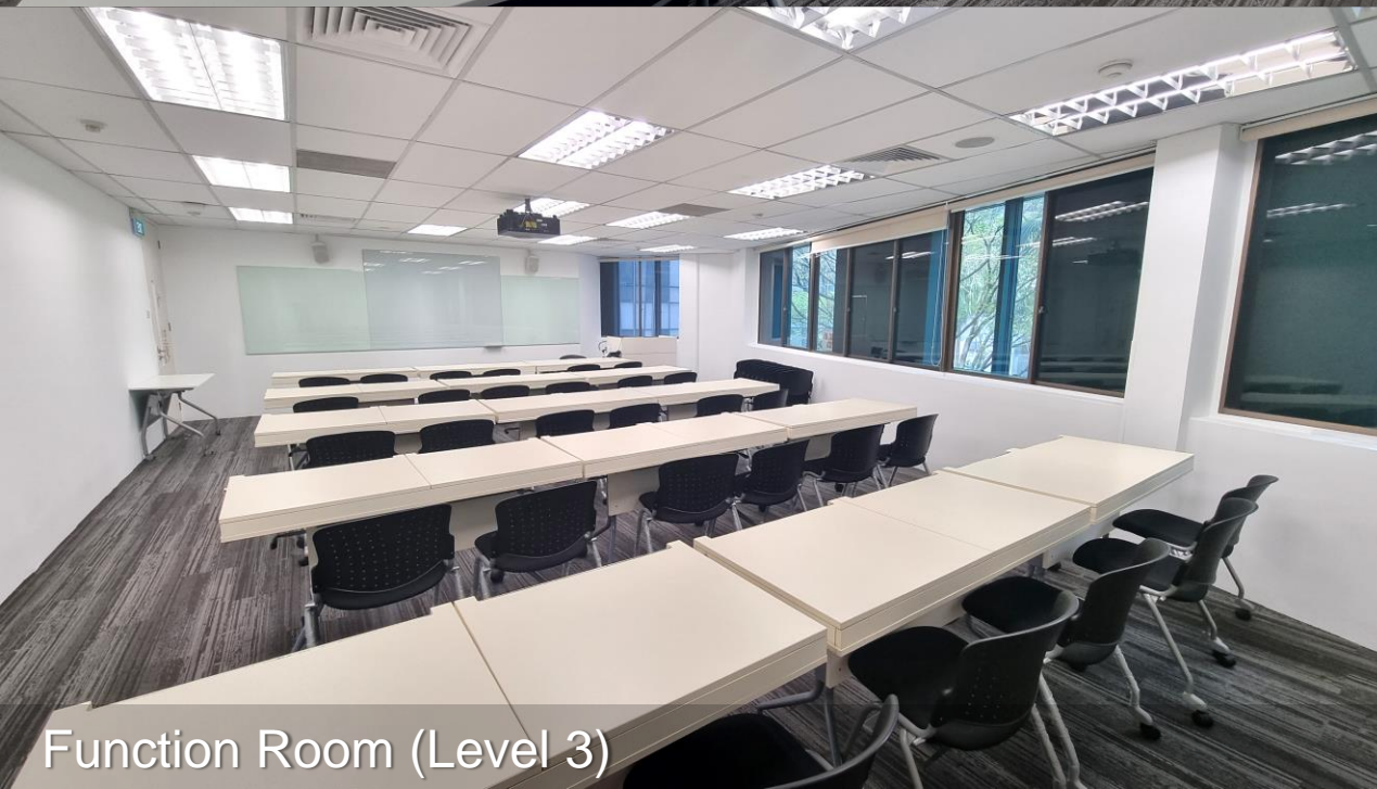
Function Room (Level 3)