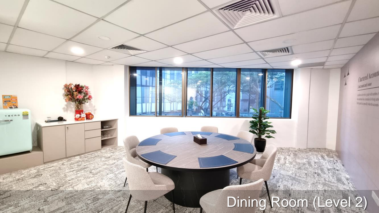
Dining Room (Level 2)