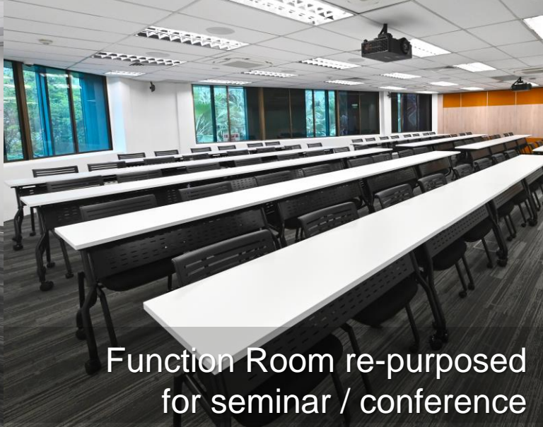
Function Room re-purposed for seminar / conference