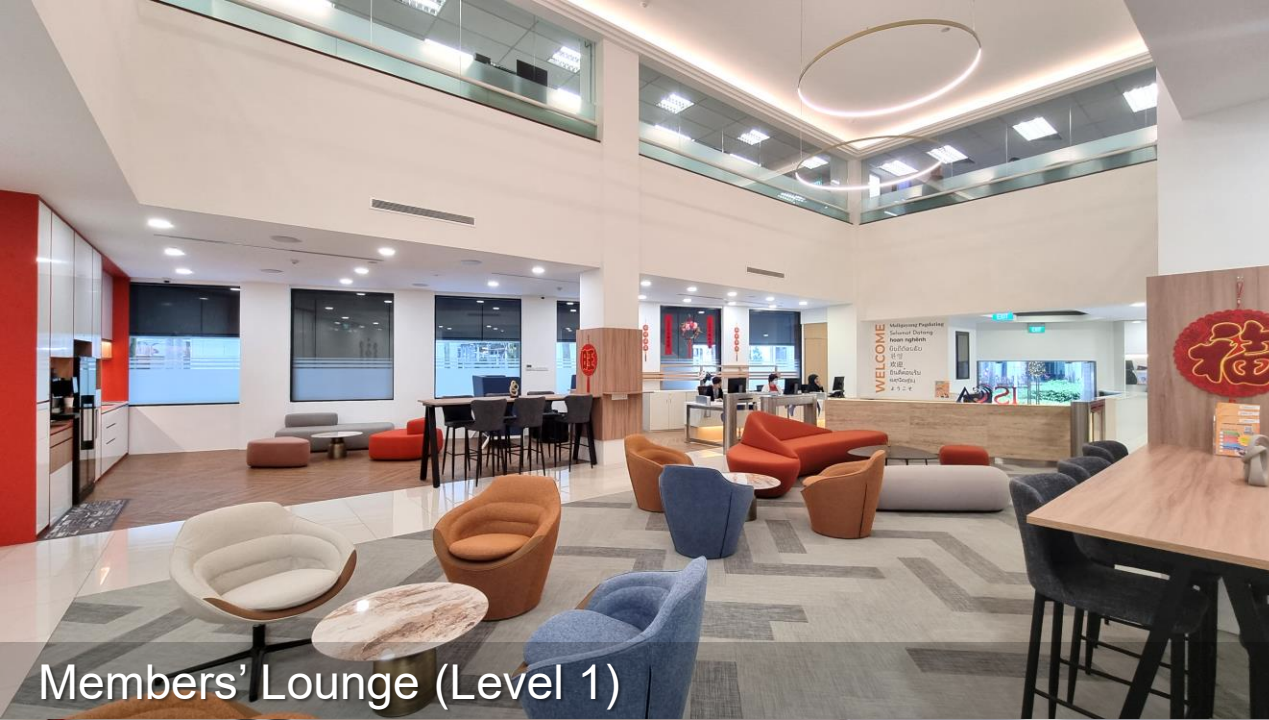
Members' Lounge (Level 1)