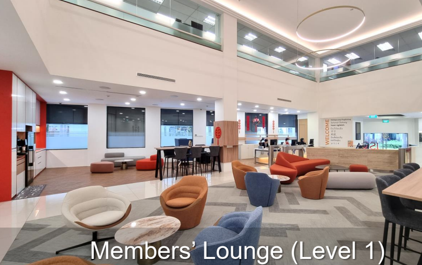
Members' Lounge (Level 1)