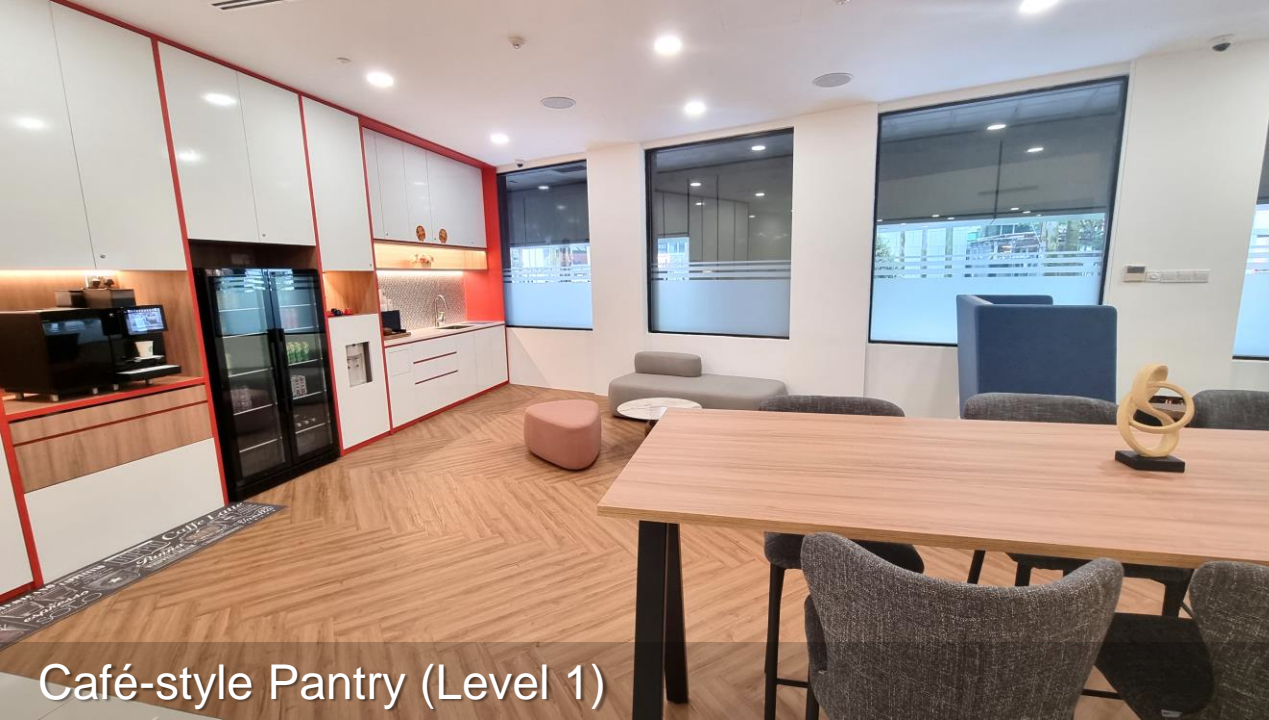
Café-style Pantry (Level 1)