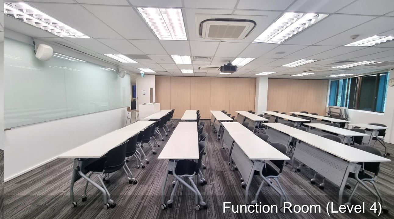
Function Room (Level 4)