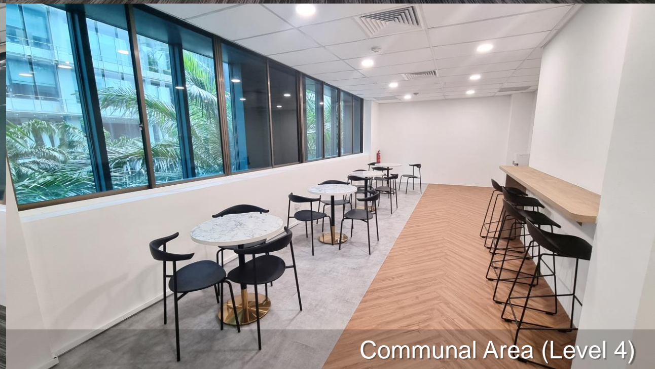
Communal Area (Level 4)