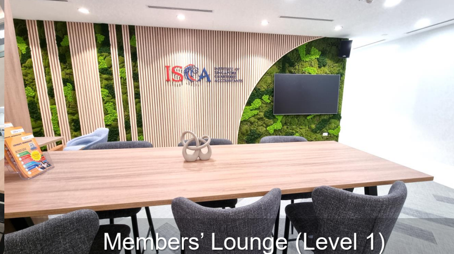
Members' Lounge (Level 1)