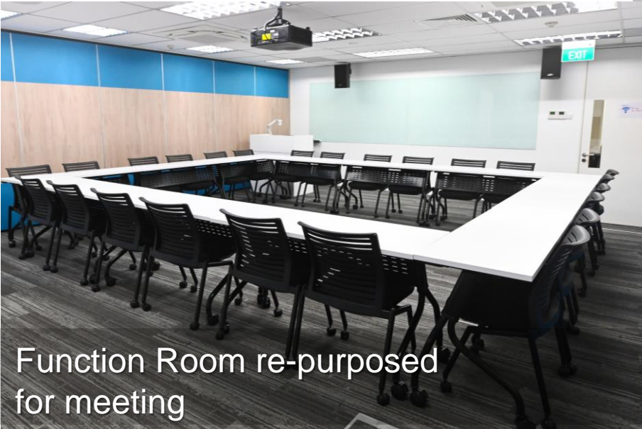
Function Room re-purposed for meeting