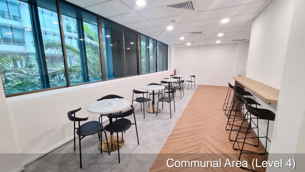
Communal Area (Level 4)