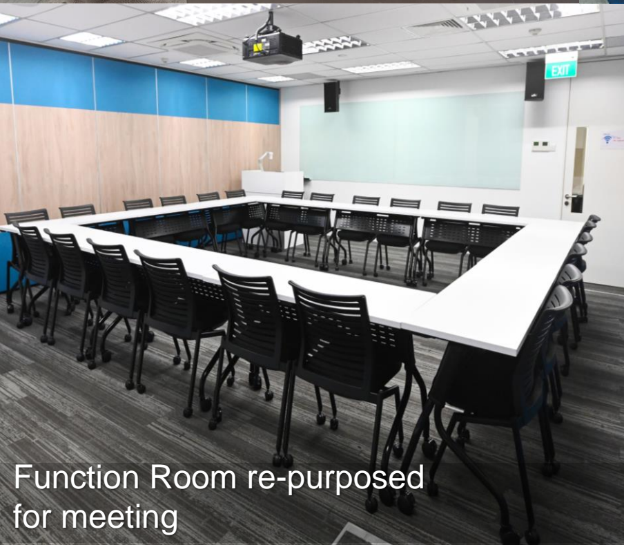
Function Room re-purposed for meeting