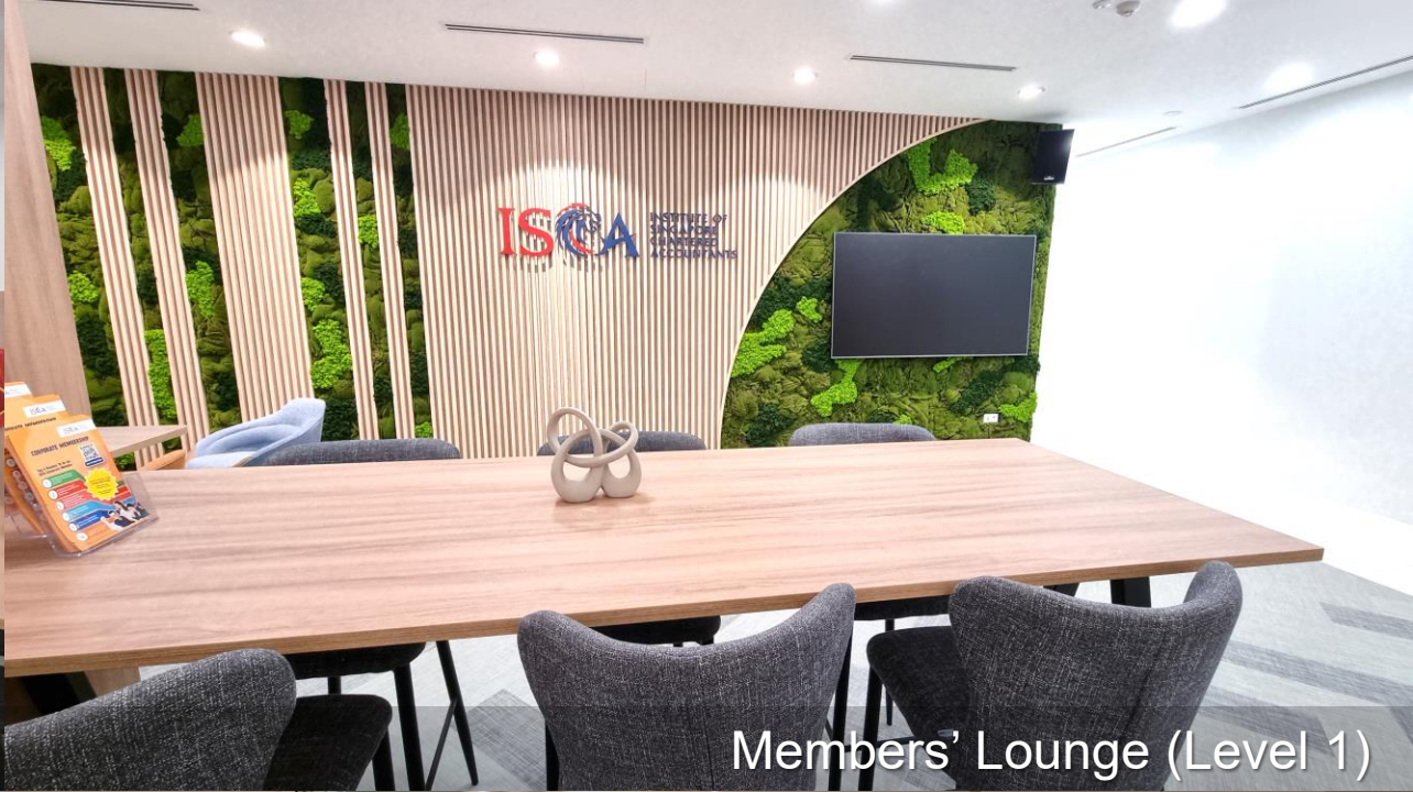
Members' Lounge (Level 1)