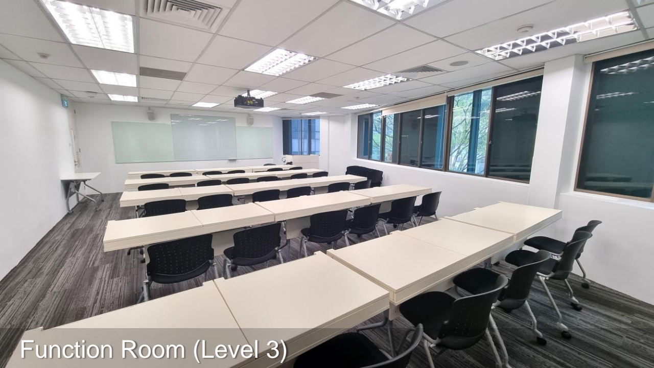
Function Room (Level 3)