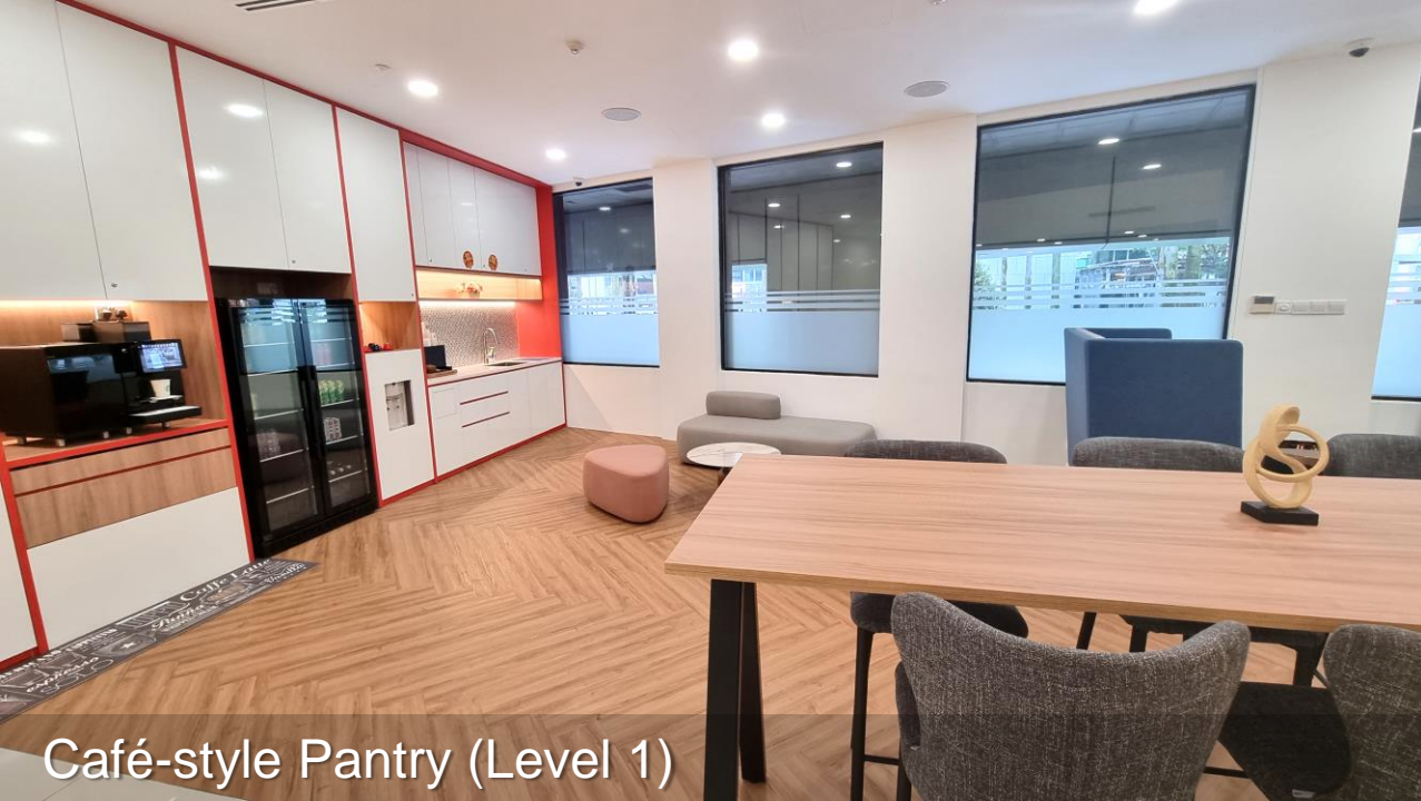
Café-style Pantry (Level 1)