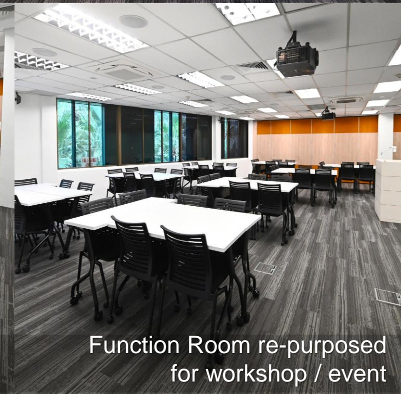
Function Room re-purposed for workshop / event