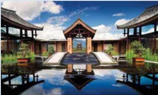
Banyan Tree Lijiang