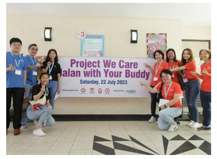
Shopping carts and hearts were filled in this heartwarming and meaningful grocery shopping experience.

The impactful exchange of knowledge and motivational words is poised to leave a lasting impression on the girls, propelling them toward financial independence and a promising future. As we plant the seeds of financial empowerment in these young minds, we are nurturing a brighter future for the community.