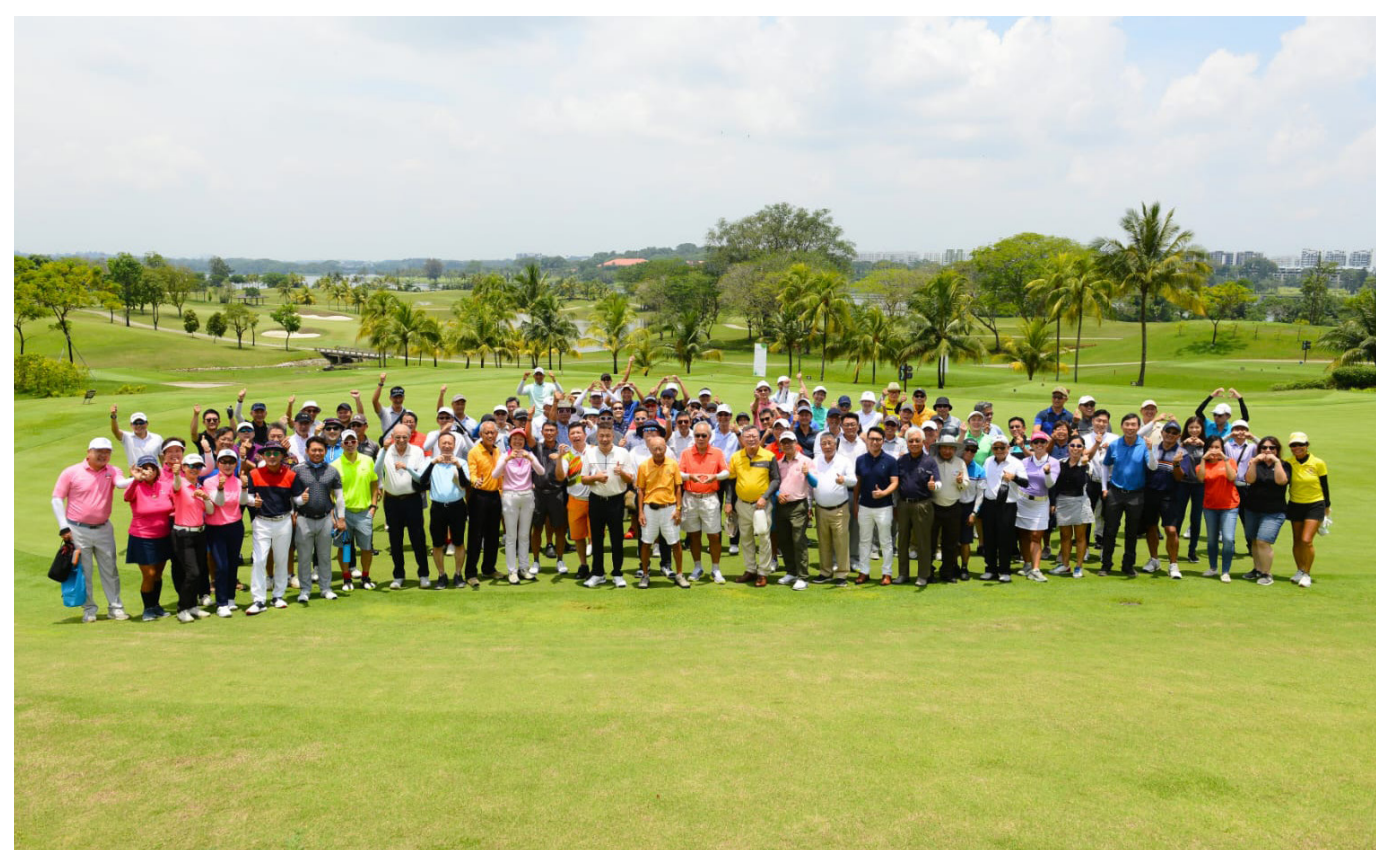
Strong support from the accountancy community for ISCA Cares Charity Golf 2023!