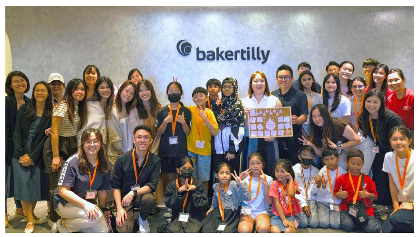
Inspiration was sparked for children beneficiaries during their visit to Baker Tilly Singapore.