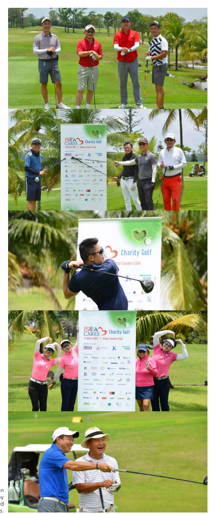
Putting the fun in fundraising! Happy moments of swings and smiles from the golfers.

The funds raised will extend a helping hand to more accountancy students from humble backgrounds in Singapore by providing them with opportunities that are aligned with their potential, ensuring that financial challenges do not impede their path to excellence in the field.